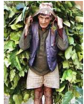
Local Nepali farmer