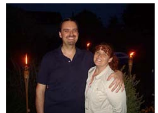
ACF "Grill 'n Chill"