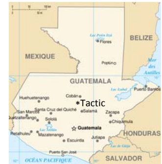
Guatemala w/Tactic Noted