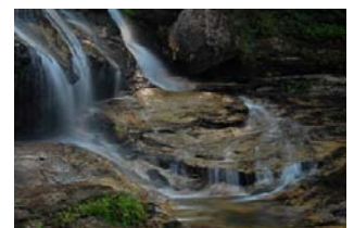
North Carolina Waterfall