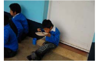
Meal at Rio de Vida School

My challenge this year is to recognize the journey, love all those around me on the journey, and soak in the wonder and wildness of life, and truly find all the freedoms in obeying God. May God bless you richly on your 2012 journey, and I pray your journey draws you closer to His purpose for your life.