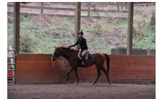
Candy's old pony in WA