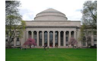
MIT's 150 th Celebration