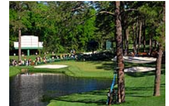
Masters Practice Round