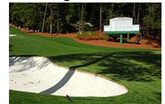
Masters Practice Round