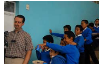
Boys at Rio de Vida School