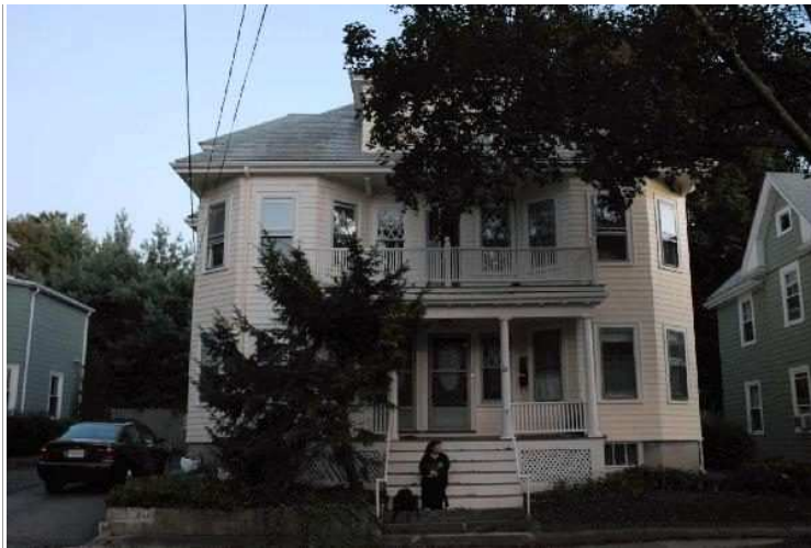
Our new home at left (first floor only)

Many have asked how we could go from living on 5 acres of wooded Washington wilderness to a suburban/urban setting. While it has been a definite adjustment we continue to look at the positive things of our current situation.